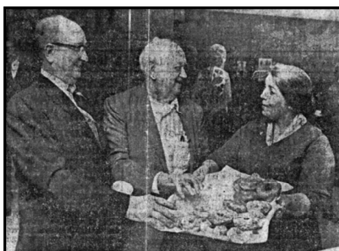
Tuesday, March 5, 1974 - The York Dispatch

As we continue growing our membership and our service to our community we look towards the future where we will eventually celebrate another 50 years together in our community.